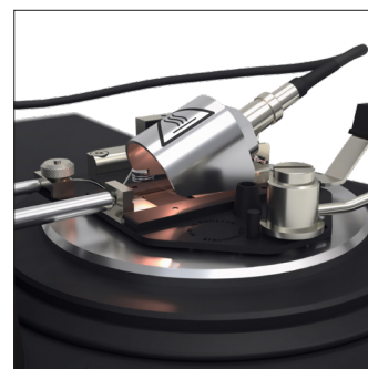
Automatic dip of ignition source and flash detection