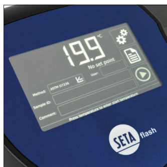
Select test temperature