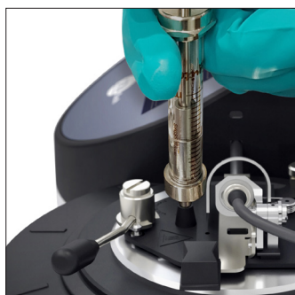
Inject 2ml sample